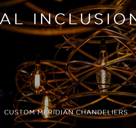
CUSTOM MERIDIAN CHANDELIERS