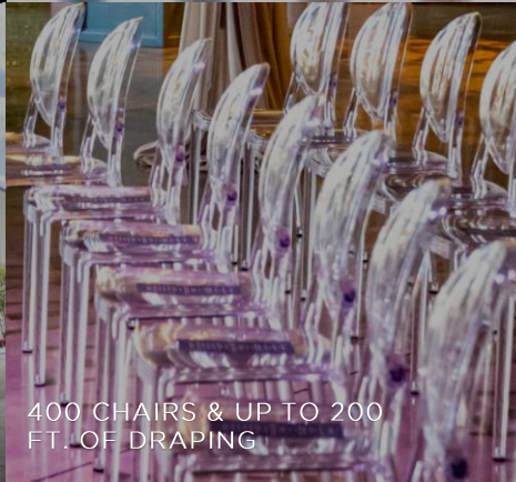
400 CHAIRS & UP TO 200 FT. OF DRAPING