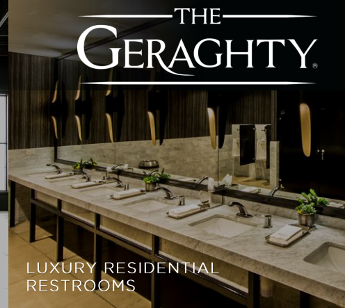
LUXURY RESIDENTIAL RESTROOMS