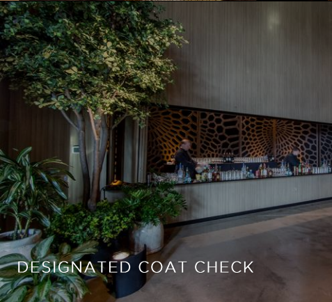
DESIGNATED COAT CHECK