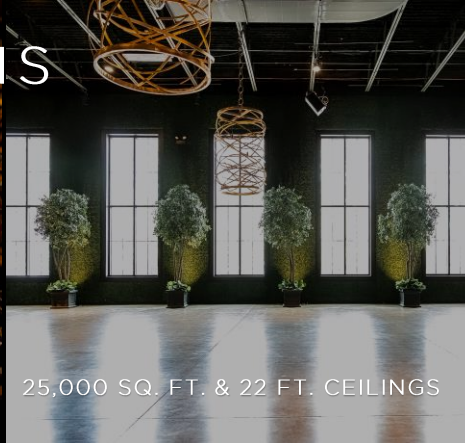
25,000 SQ. FT. & 22 FT. CEILINGS