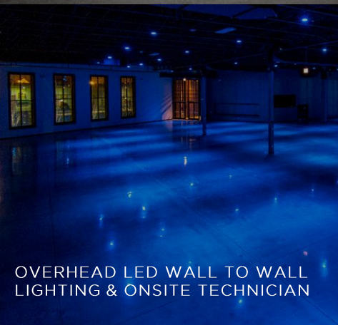
OVERHEAD LED WALL TO WALL LIGHTING & ONSITE TECHNICIAN