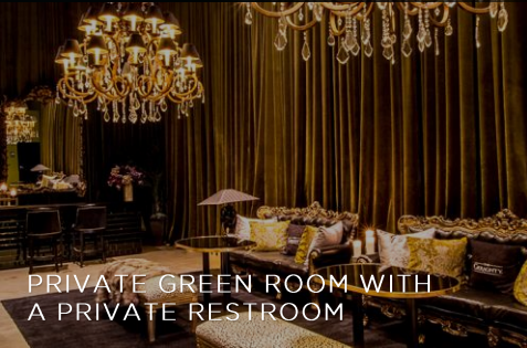
PRIVATE GREEN ROOM WITH A PRIVATE RESTROOM