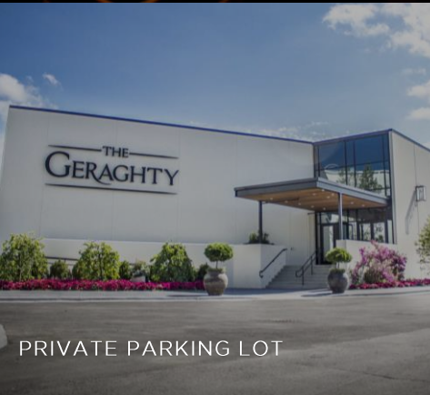
PRIVATE PARKING LOT