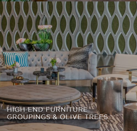
HIGH-END FURNITURE GROUPINGS & OLIVE TREES