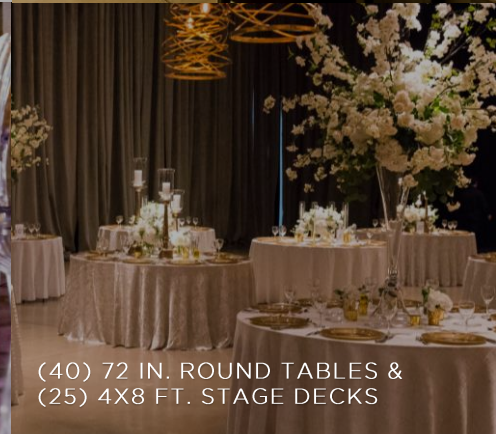
(40) 72 IN. ROUND TABLES & (25) 4X8 FT. STAGE DECKS