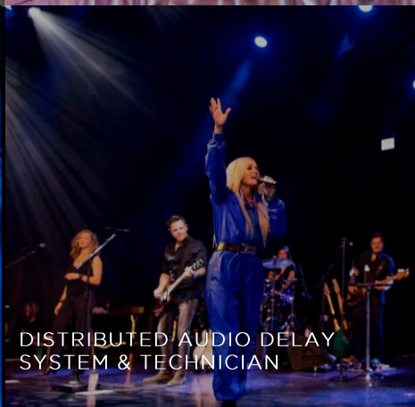
DISTRIBUTED AUDIO DELAY SYSTEM & TECHNICIAN